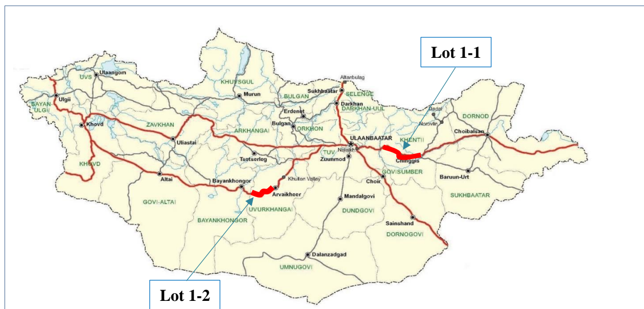
Picture 1. Locations of the Project Roads

However, some parts of the road sections are causing a bottleneck to the road traffic from the capital